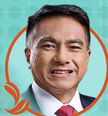
Darwin Cyril Noerhadi

Minister of Indonesia Working Cabinet, 2014-2019